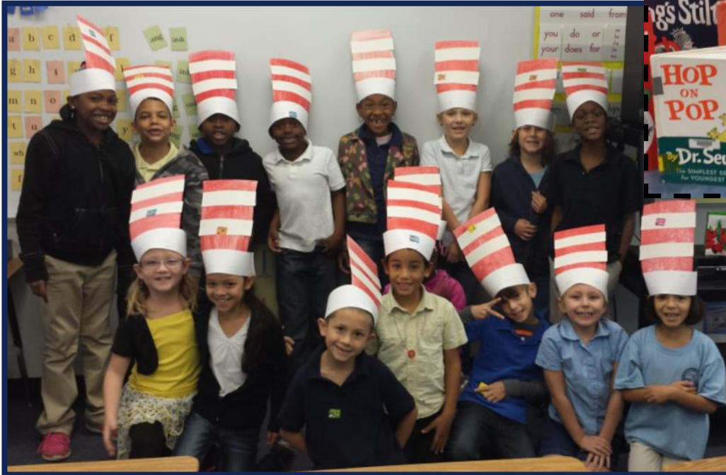
Above: Celebrating Dr. Seuss's birthday by reading to students at Pelican Island Elementary.