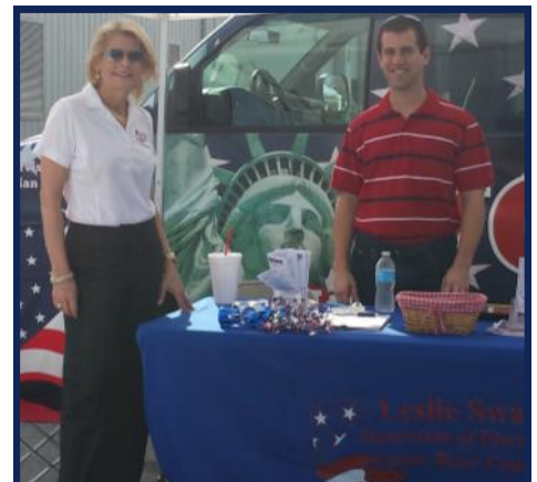
Above: Proud participants of the 2014 Sheriff's BBQ.