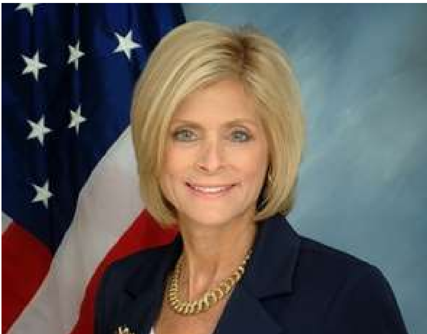
PAGE 2 | MESSAGE FROM THE SUPERVISOR