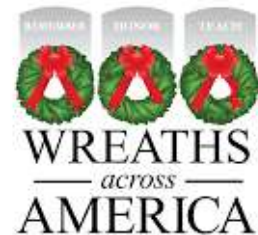
PAGE 4 | WREATHS ACROSS AMERICA